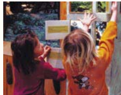
Hatches in the exhibition makes everyone curious. You may put your hand in the bear's mouth and touch his tongue – if you dare.